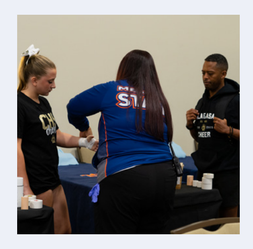
SAFETY ASSESSMENTS AND TRAININGS