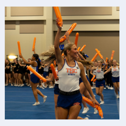
PEP RALLY AND HALFTIME PREPARATION

All services are custom to the needs, requests, and goals of your program. If you are interested in bringing TSC in to work one-on-one with your program, or coaching staff, reach out directly to the email address below to start the booking process.